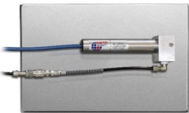
Pressure sensor on anchoring plate