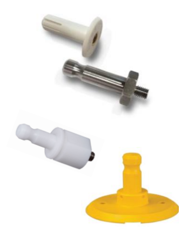
Special bayonet fitting in stainless steel or in PVC for wall or floor mounting.

Provided with removable metal tag and with soft case .