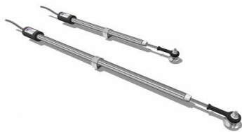
Crack meter sizes

CE product compliant with European directives