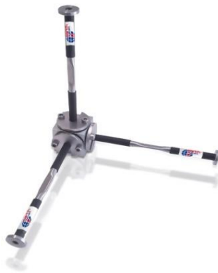
Position of the strain gauge in 3D

The vibrating wire strain gauge is widely used to measure the deformation in concrete.